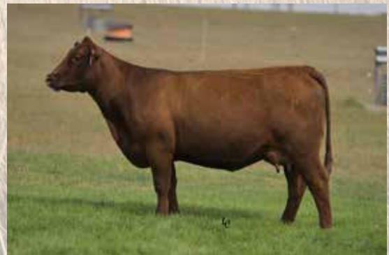
C-BAR LEANNA 921G

Here's a lady to you could build a herd around! Her deep bodied feminine profile will leave you hoping for more heifer calves to keep. Her dam, C-BAR LEANNA 921G, was quickly promoted to our donor group because of her style, great udder and easy disposition. The longevity is apparent in this line! Outcrossed to the Canadian RED RESOURCE line, L3246 has amazing potential.