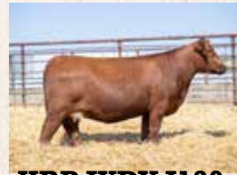
HRP JUDY J120