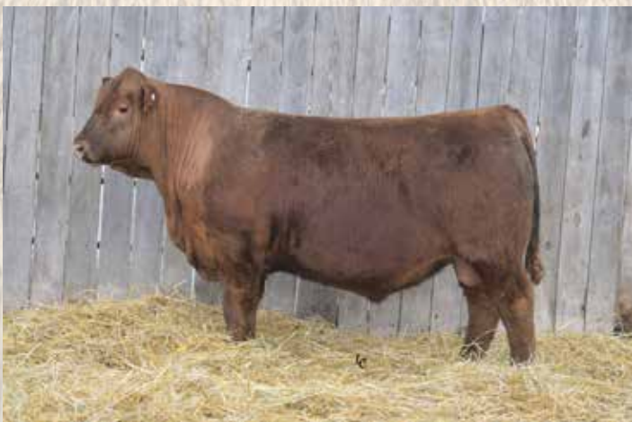
BIEBER ROU TROJAN G14