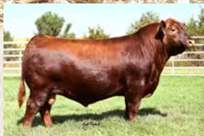
PIE CAPTAIN 057