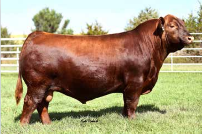
PIE CAPTAIN 057