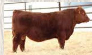
BB LEGITIMATE 2165