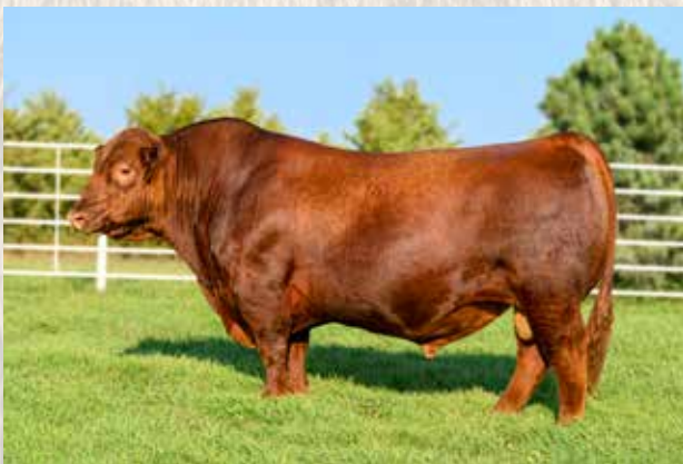
PIE QUARTERBACK 789

Here is one of our favorite bulls, both from his pedigree and his performance! Take the power of PIE QUARTERBACK 789 cross it with the soft phenotype HXC 507C, the dam of KJL/CLZB COMPLETE 7000E, and the result is amazing. An EPD profile that is in the top of the breed, this bull will make an impact on your next generation!