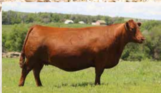
MATERNAL GRAND DAM PIE RUBY 520