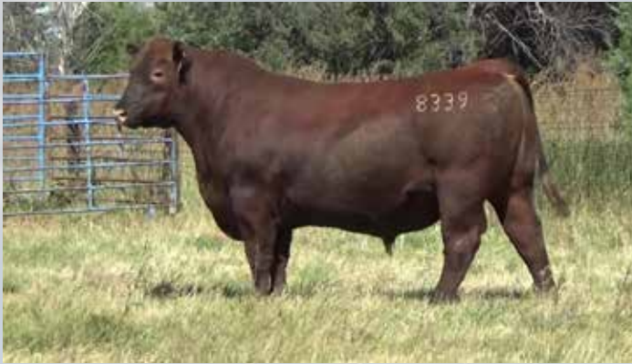
PIE YELLOWSTONE 8339