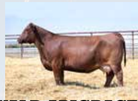
BERWALD ABIGRACE 0019