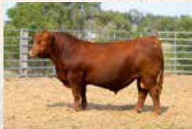
HRP TROJAN 1004J