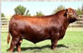
PIE CAPTAIN 057