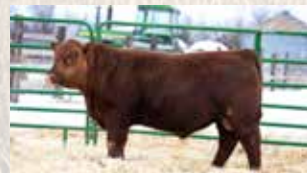
C-T REPUTABLE 2010