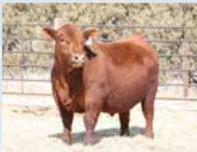
PIE HOLLYWOOD 222

The winner of this lot will get to comb through any and all the heifers born this year and take home their favorite. These heifers were bred to be our next generation so the genetics are outstanding. Featuring exclusive sires such as PIE HOLLYWOOD 222, HRP TROJAN 1004J, HRP RAIDER 2020K, PIE INTENSITY 295 as well as breed leading sires like COMPLETE 7000E, GENUINE 195C, QUARTERBACK 789, CAPTAIN 057 and our herd-bulls including C-T REPUTABLE 2010, BB LEGITIMATE 2165, BEIBER HERDSMAN H120. The cows behind these heifers are just as impressive, come take a tour before picking your heifer to see her with her mother!