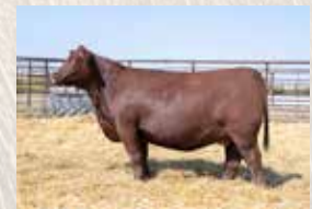
9 MILE RUBY 520-0342