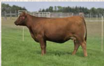
C-BAR LEANNA 960G

Here is a CAPTAIN son that does everything! Thick muscle and stout stance he's ready to go to work. Deconstructing his Top 2% ProS index, shows 8 EPD in the top 10% of the breed along with another 8 EPD in the top quarter of the breed! Lining up nicely with his actual performance and ultrasound data he is off the charts good. Full flush brothers sell lots 69, 70, 71