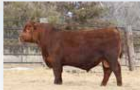
PIE INTENSITY 295