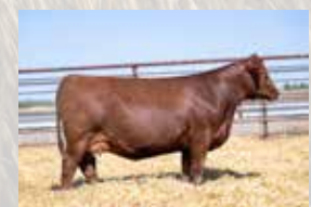
9 MILE ENVY X6631-0215