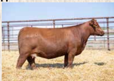
HRP JUDY J120

This could be the most exciting bull in the sale! There are only 2 CONNEALY CLARITY sons registered in the Red Angus database and they are BOTH in this sale! Imagine the next generation of outcross genetics from the progeny of this Black-Red carrier bull. His EPD speak for themselves – plain awesome growth and carcass characteristics. Out of possibility our best COMPLETE daughter, JUDY J120, this bull brings power, size, style and genetics in surplus. This is a bull we plan on using in our own herd.