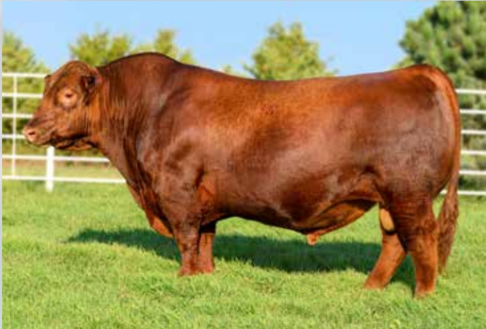
PIE QUARTERBACK 789