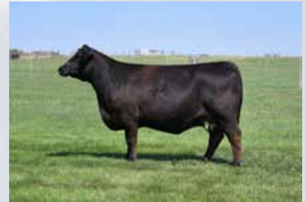
9 MILE LAKOTA 507-0378

Outcross Genetics WOODHILL BLUEPRINT Maternal Grandsire 120 Rib-eye Ratio-TOP 1% YWT