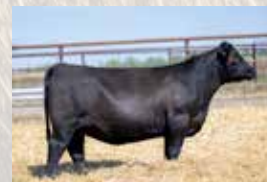
PIE DELLA 2365