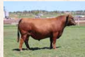
5L GENUINE 195C